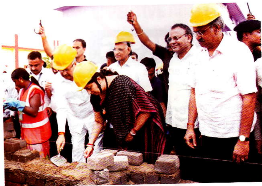
The Union Minister for Textiles and Information & Broadcasting, Smt. Smriti Zubin Irani participating in the cleanliness drive at the 'Swachhta Hi Sewa' campaign at Village Kendri, District Raipur on September 17, 2017.

children. Further, the Mission sought to promote gender sensitive information, education and communication/ behavioral changes. The Mission issued Gender guidelines in 2017 and Menstrual Management Guidelines in 2015.